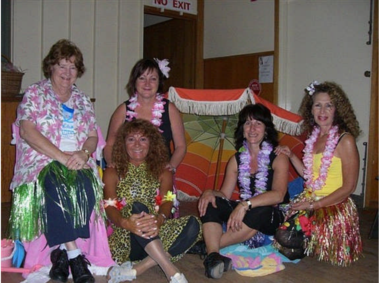
Purim 2 nd of March