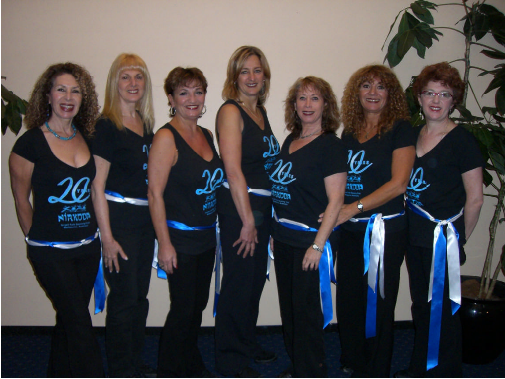
Nirkoda Performance Troupe 23 rd of May