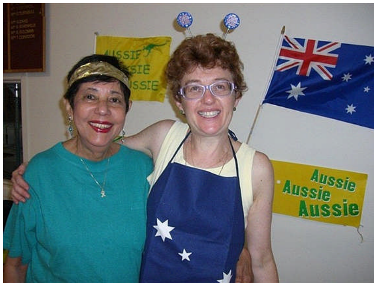
Australia Day 26 th of January