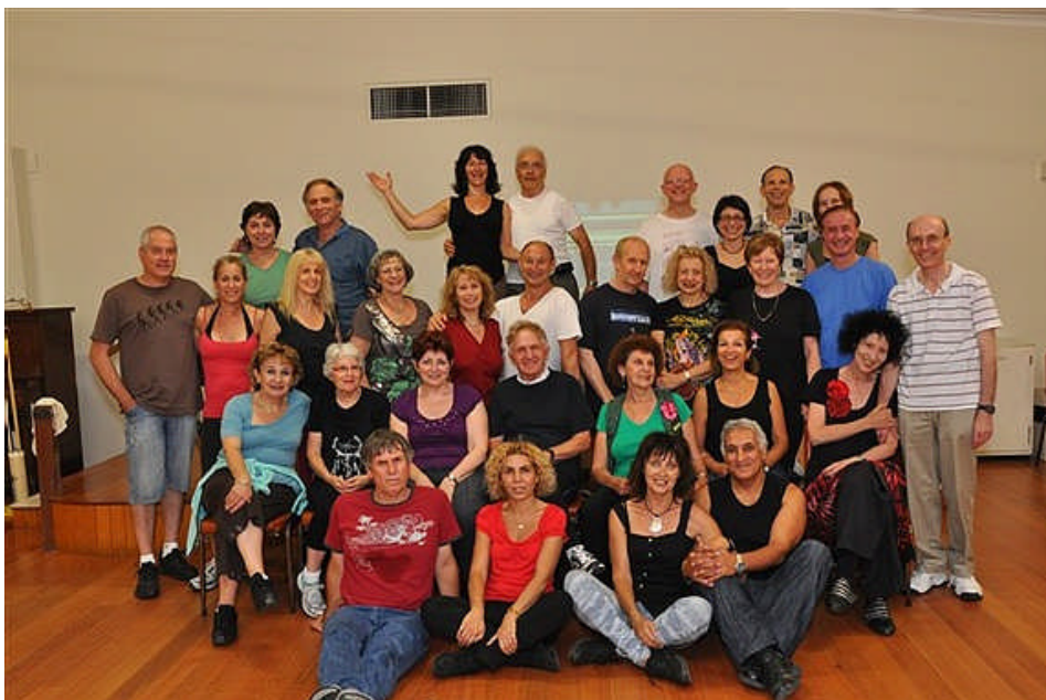
Partners Marathon 7 th of March