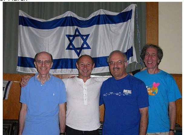
Yom Ha'atzmaut celebration