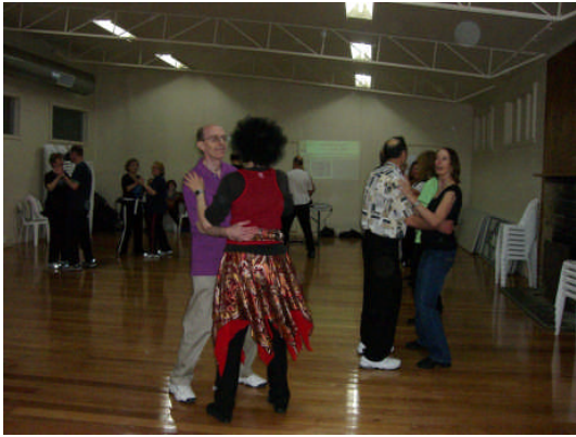
Marathon Queens Birthday