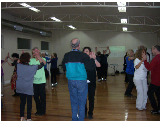
Marathon Queens Birthday