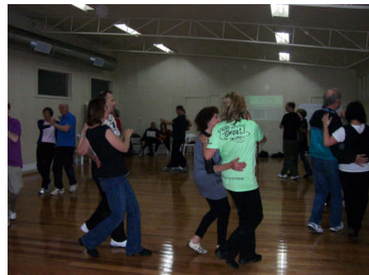
Marathon Queens Birthday