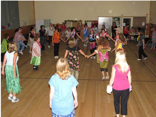
Purim 2 nd of March